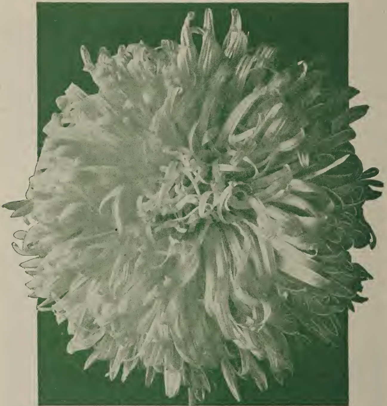
Aster New Super Giant Los Angeles

Asters raised from your seed were mistaken for Dahlias.